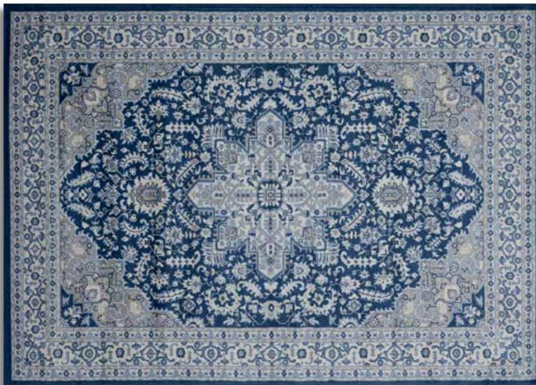
4000 40161/Denim Blue