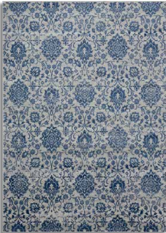
4000 40261/Denim Blue