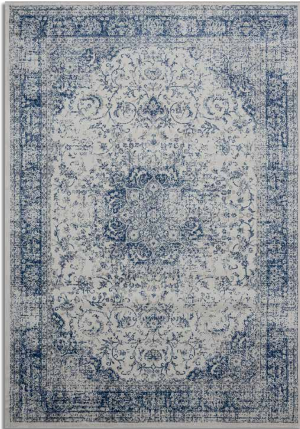
4000 40061/Denim Blue